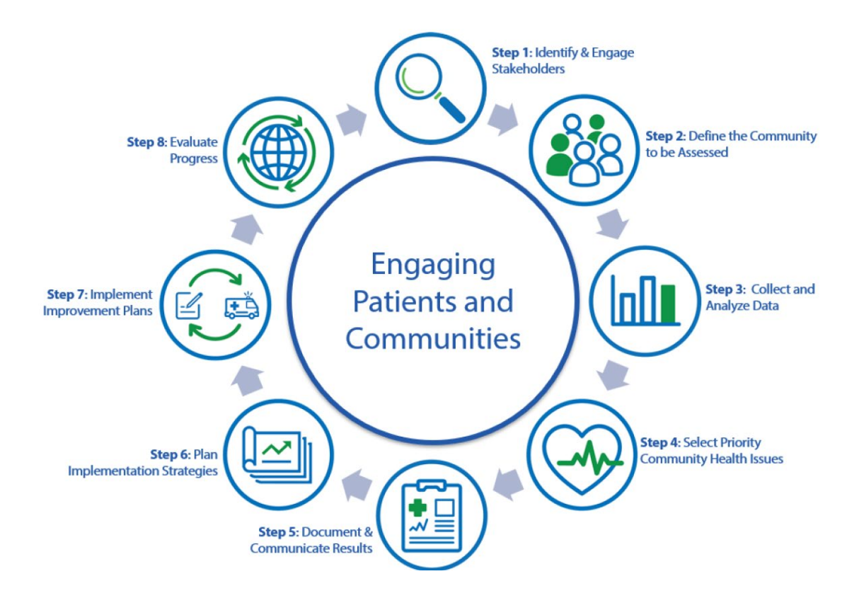
Figure 1: Best Practices for Engaging Patients and Communities in the CHNA Process

Staff recommend including a self-assessment in the community benefits reporting guidelines. Hospitals will be required to report the extent to which they performed these best practices. Hospitals will give themselves a rating on a scale of 1 to 6 based on a typology developed by the International Association for Public Participation (IAP2). The scale ranges from the hospital informing members of their community to the community itself driving the development of the Community Health Needs Assessment.